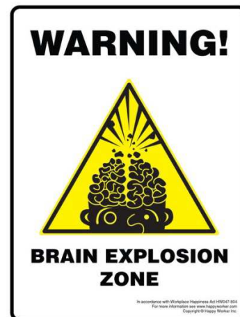
Figure 2. SQL ?!?! Ba boom

Sets are abstract, SQL seems uncontrollable, Cartesian products can be the unfortunate result of missing a single join criteria, arrgghh... SAS and data step are so much friendlier.... ☺